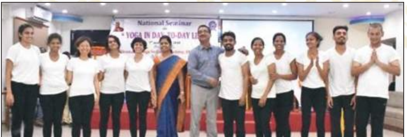
Faculty members & students from the Department of Yogic Science participated in a National Seminar organised by Sivananda Yoga Vedanta Academy on 7 th -8 th April, 2018.