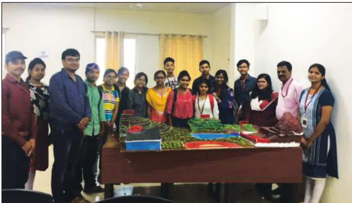
Students of Faculty of Agriculture during the demonstration of a model developed for soil and water conservation techniques in agricultural landscapes.