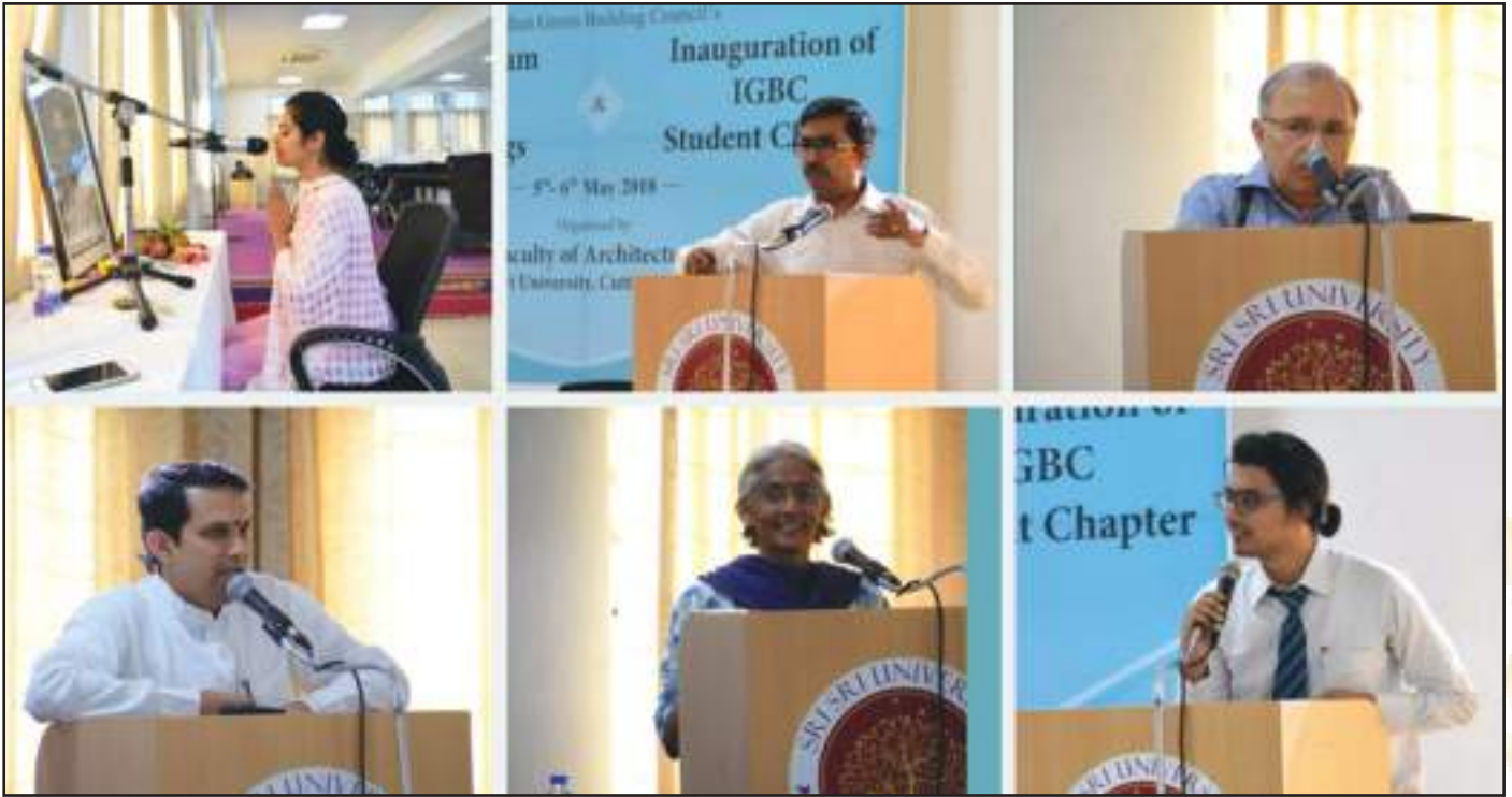
Training Programme on Green Buildings in collaboration with CII Indian Green Building Council (CII IGBC) in progress at SSU.