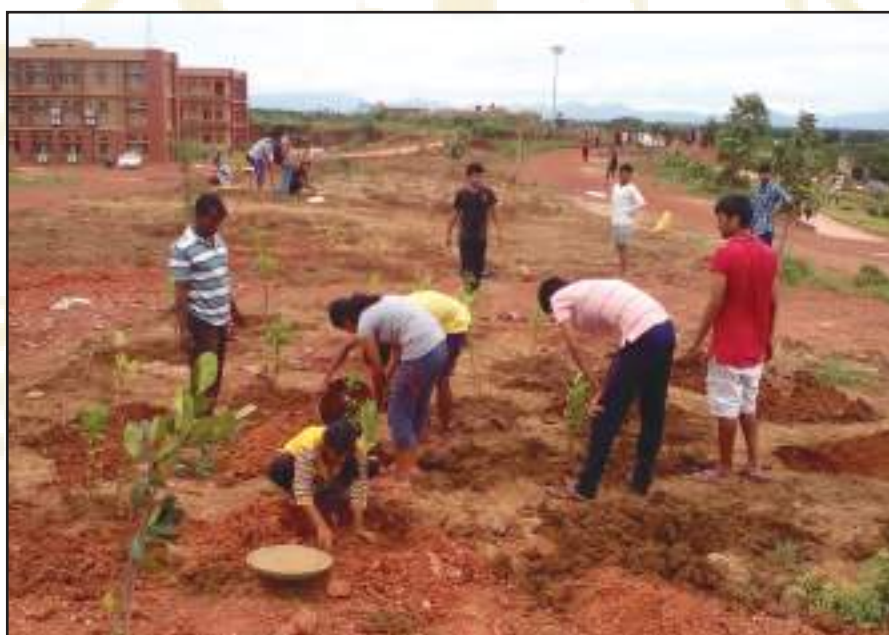
‘Green Revolution’ at SSU