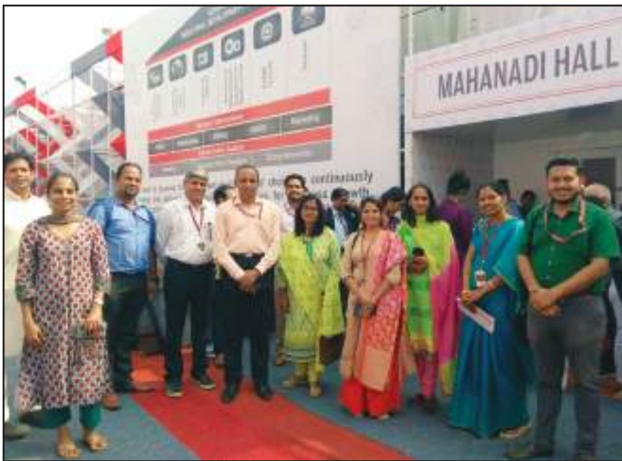
Team SSU at the Mahanadi Pavilion during the Conclave